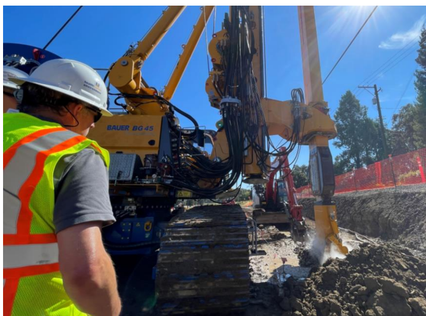
Reach A: Breaking ground for cutoff wall demonstration section.